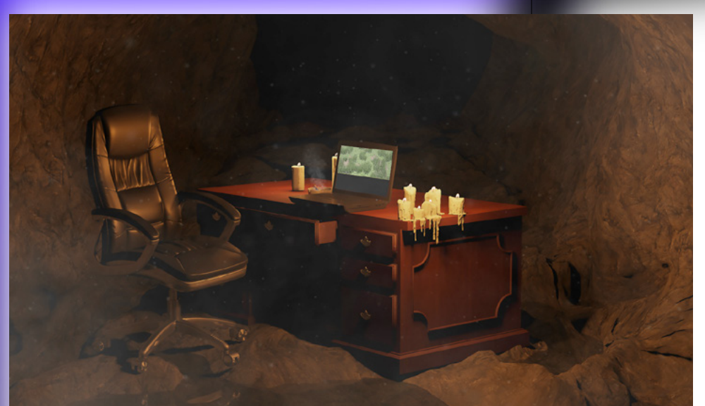
Max de Waard, The Fountain Of Youth (2016), still.

Many of the theories you come across online are less at odds with everyday reality. There's a worrying twisting of the truth in the present media landscape – a subjective distortion that is rooted in a profound mistrust of the system. Take the US presidential elections, for example. People read this stuff, tell it to each other and to their children, and it becomes 'true'.